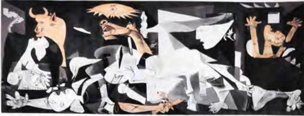
Guernica, 1937 245cm x 224cm

Guernica es la reacción del pintor sobre el bombardeo de la ciudad de Guernica, durante la guerra de España, que cambió la anti guerra. Este obra es azul, negro y blanca. Esta en el museo nacional de Madrid. Picasso es que la pintura representa la brutalidad y la atrocidad de la guerra. Es la pintura la más famosa de Picasso y es un símbolo de protesta. Esta obra participa a menudo la memoria de la abominación de la ciudad vasca. Desde 1937 esta obra es una obra del arte moderno.